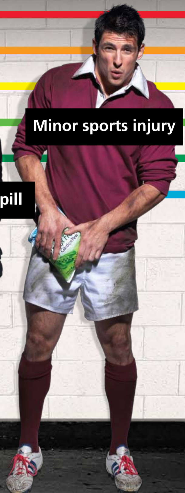
Minor sports injury

For less severe symptoms Know your choices